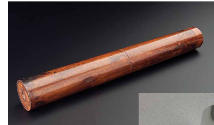
Laennec stethoscope, invented 1816

“Technology has only accelerated, and we have to be lifelong learners. As my favorite Bob Dylan line goes, ‘He not busy being born is busy dying.’”