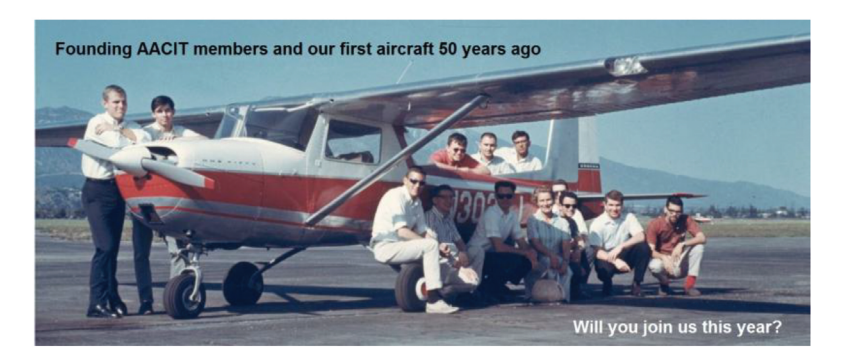
Visit aacit.org for more information.