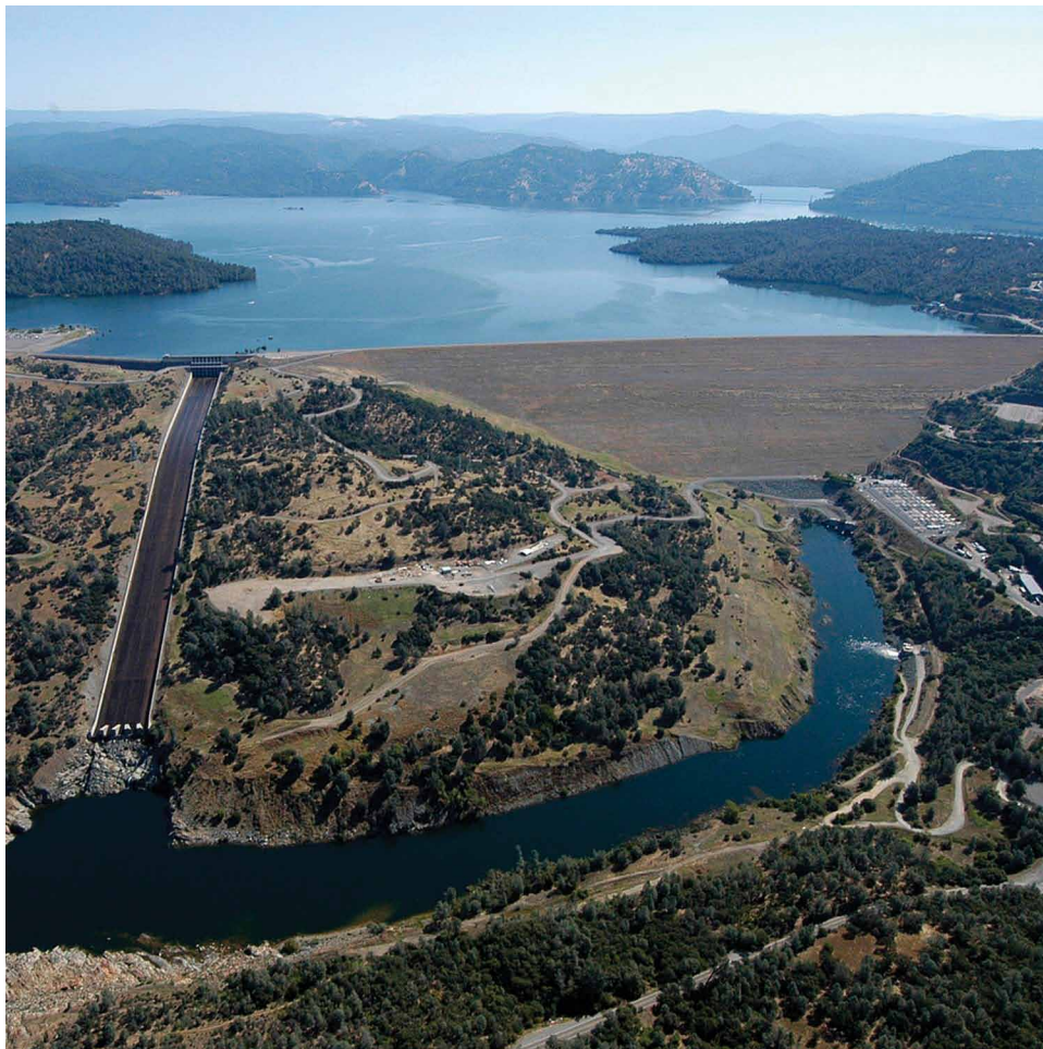
Lake Oroville and reservoir is the largest storage facility for the State Water Project.

pollution, almost 20 percent of the capacity of the aqueduct (enough water for about a million people) is now being returned to the dry lake bed just to keep the surface moist so dust doesn't form. Additionally, another 15 percent of the aqueduct capacity is now being returned to Mono Lake to protect it from a similar fate. Mono Lake is a crucial stop-over for migrating birds. Because of these and other environmental issues, the Los Angeles aqueduct is delivering only about half of its capacity. But people shouldn't have to develop lung cancer so others can have water, and the wildlife deserves protection. It's interesting