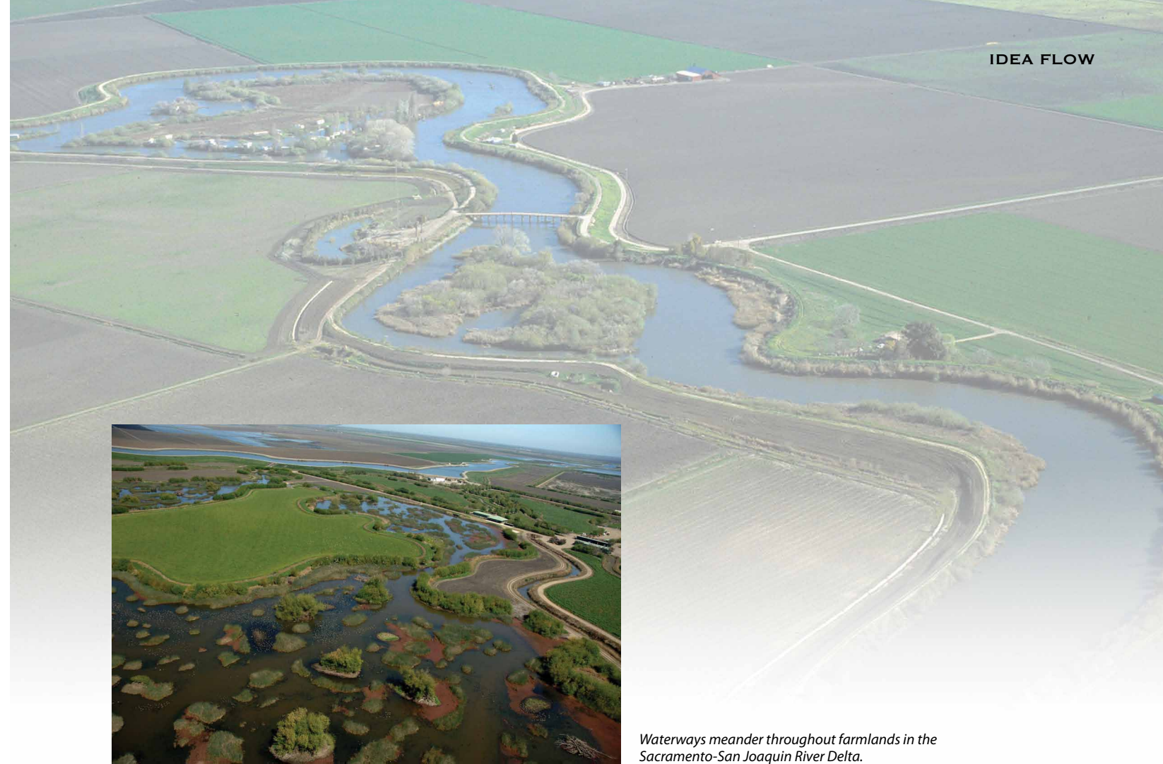
Waterways meander throughout farmlands in the Sacramento-San Joaquin River Delta.